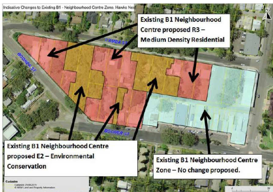
Figure 2 – Indicative zoning showing Area A in pre-exhibition Planning Proposal document