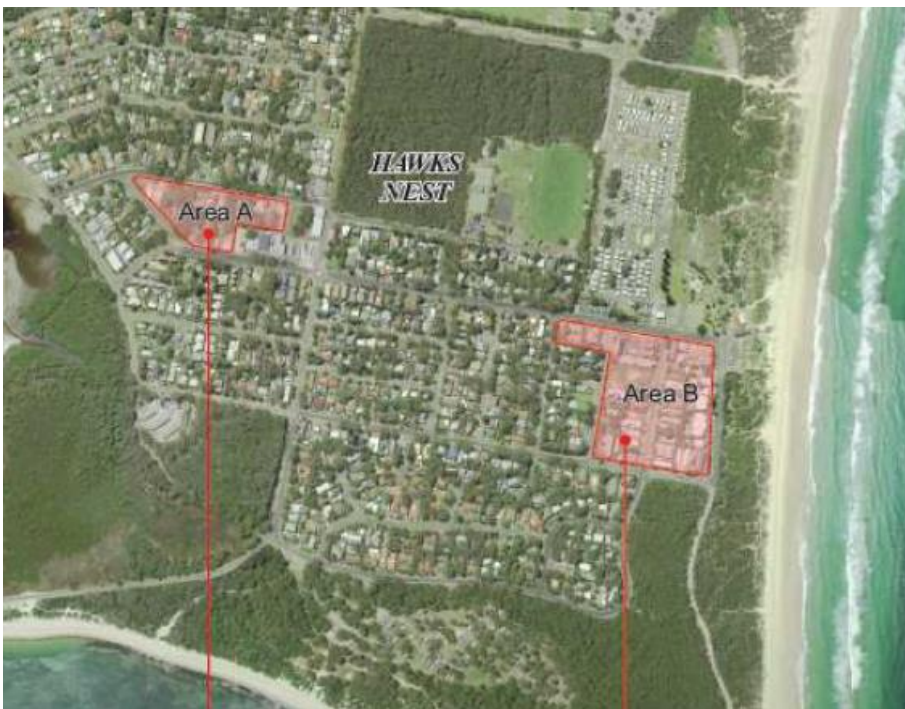
Figure 1 – ‘Area A’ and ‘Area B’ identified in the Planning Proposal

The Planning Proposal applies to land in the Hawks Nest village centre (refer Figure 1 ).